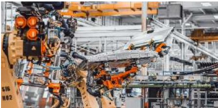
Welding and Joining Systems