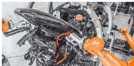
Final Assembly and Conveyor