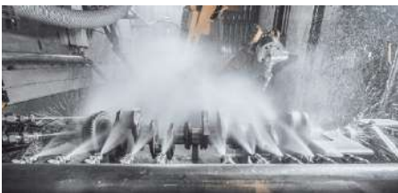
Industrial Parts Washers