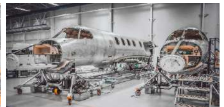
Aerospace Assembly Systems and Tools