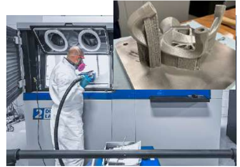
3D Printing – Metal and Thermoplastics