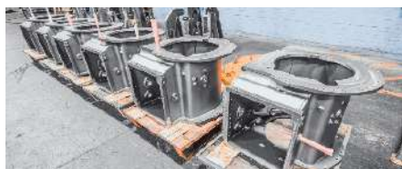
Heavy Industry Components