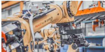
Engineered Hemming Solutions