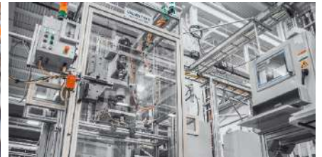
Automation, Assembly and Test