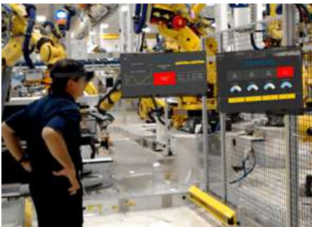
Industrial Internet of Things